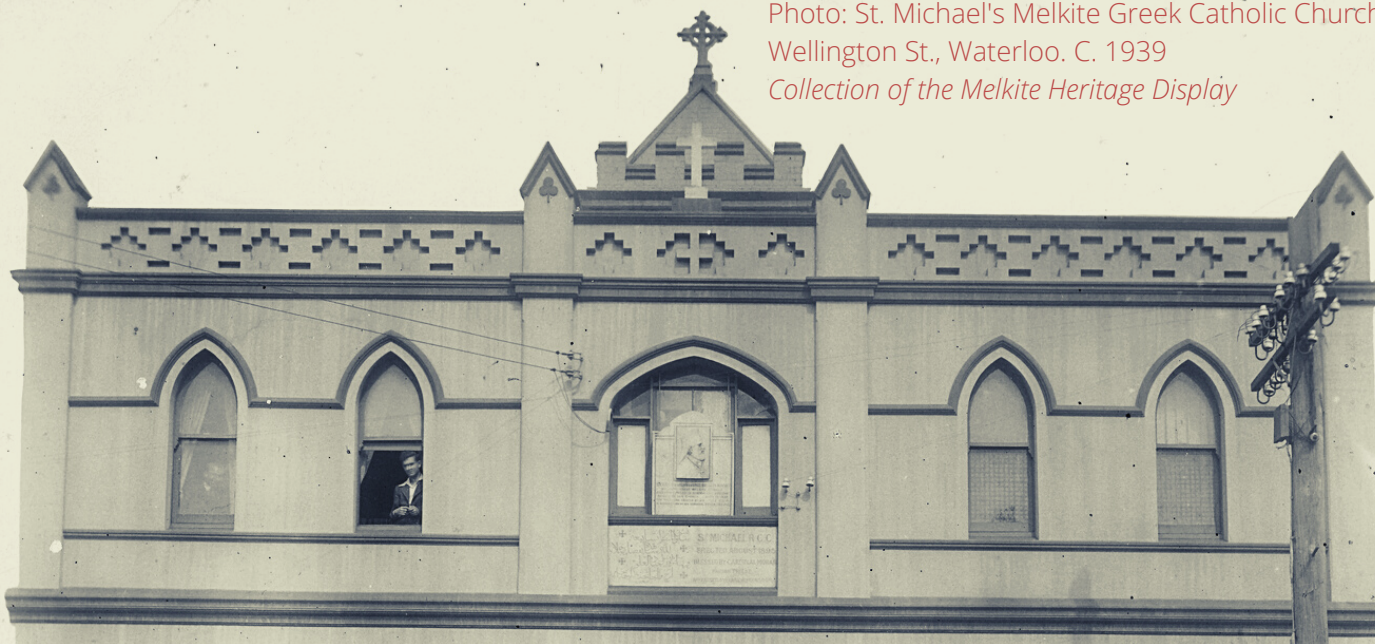
Photo: St. Michael's Melkite Greek Catholic Church, Wellington St., Waterloo. C. 1939