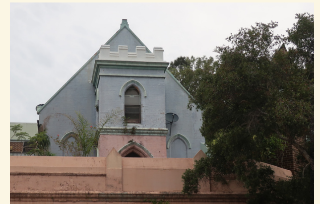
Remains of the 'original' St. Michael's Melkite Greek Catholic Church on Wellington St., Waterloo in 2019.

1987 – St. Michael's Melkite Church in Darlington is designated as Cathedral.