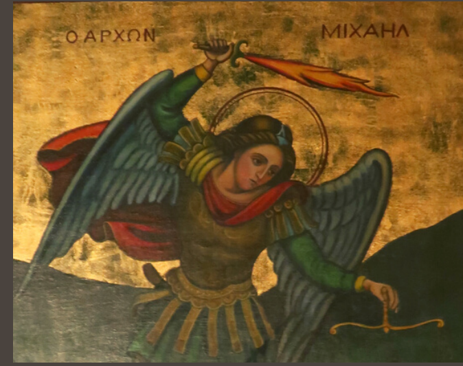
Photo: A Byzantine Icon of St. Michael the Archangel. Collection of the Melkite Heritage Display

St. Michael's Melkite Greek Catholic Cathedral 25 Golden Grove St., Darlington N.S.W. 2008